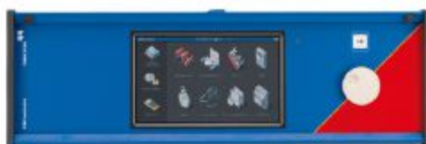
CMControl-6 Front Panel Control (option)

Besides its operation with the powerful Test Universe software running on a PC, the CMC 356 can also manually be controlled with the highly flexible CMControl unit and the CMControl App running on an Android Tablet or a Windows PC. For more information please visit our website.