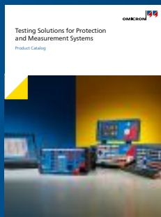
Product catalog (secondary equipment)

The following publications provide detailed information on the products described in this brochure and their applications: